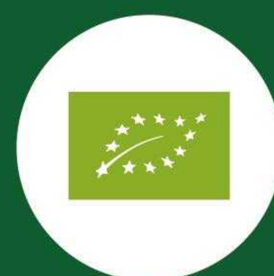
有机EU(欧盟)证书 Organic EOS (EU) Certificate