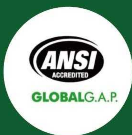
GAP证书 Good Agriculture Practice