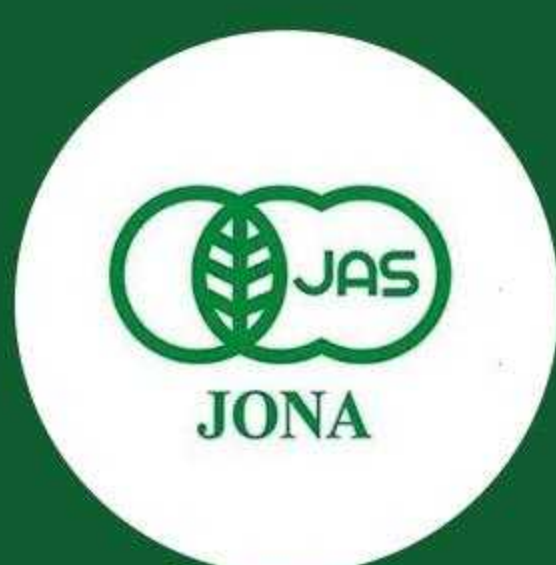
有机JAS(日本)证书 Japanese Agriculture Standard