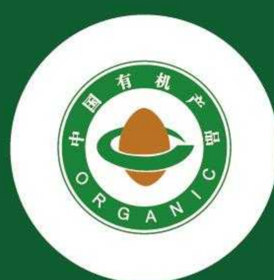
中绿华夏有机认证证书(COFCC) China Organic Food Certification Center